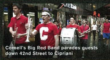
Cornell's Big Red Band parades guests down 42nd Street to Cipriani