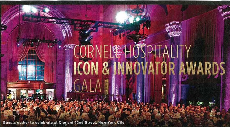
Guests gather to celebrate at Cipriani 42nd Street, New York City