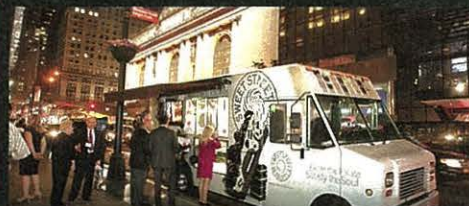
Sweet Street Dessert's One Sweet Ride stopped by to give guests a treat